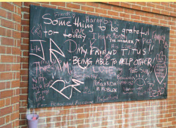
Community chalkboard invites conversation with new neighbours.