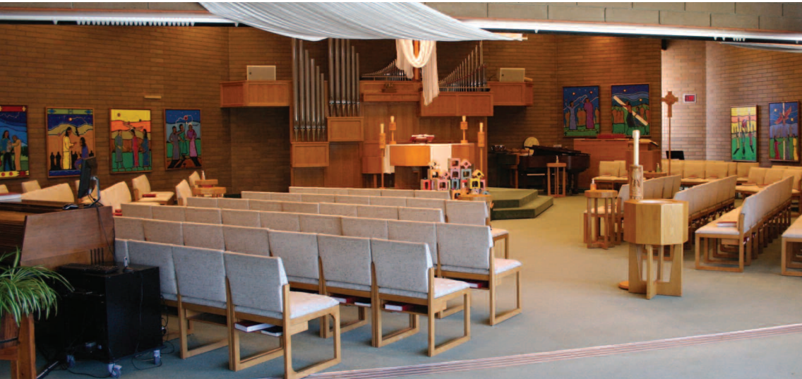
Worship space of Hosanna Lutheran, Edmonton, our first western Canadian partner congregation.

Back in 2015 an Alberta/BC Lutheran Church Canada (LCC) investment fund went broke, and many churches and individuals lost heavily. In the wake of this disaster, Hosanna Lutheran realized they wanted professional management of their assets. This year they chose ELFEC, and couldn't be happier.