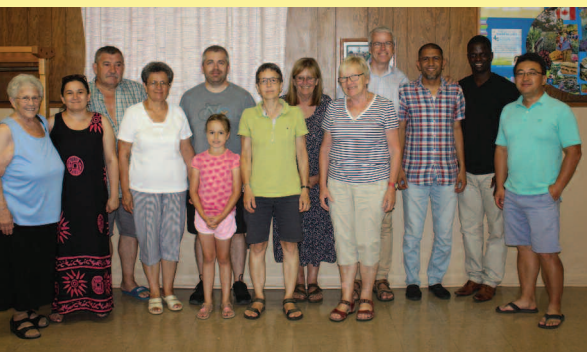
English Conversation Café is a big hit at St. John's!

Administration of the busy ELCIC Eastern Synod office is paid for by a grant from ELFEC. In this way your gifts and investments help support all the wonderful work done by the Synod across Eastern Canada.