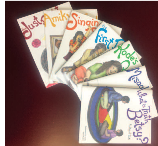
Above, part of the new Sunday School resource package funded by the Watts Endowment. Below, enjoying children's time at St. John's, Ottawa.