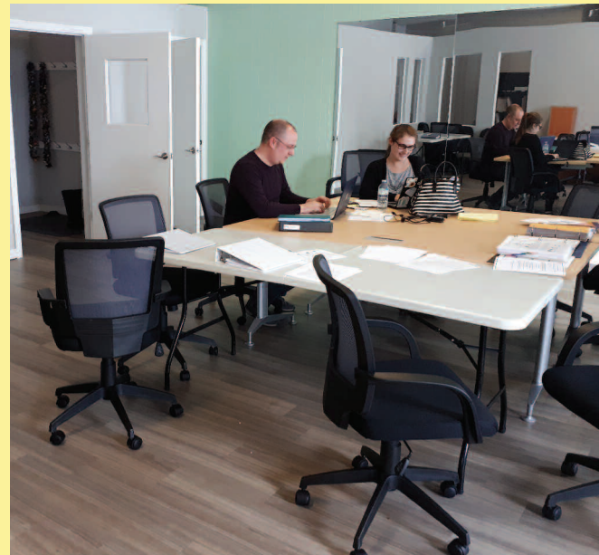
Trinity New Hamburg now boasts a newly renovated public space, thanks to a timely ELFEC partner grant.