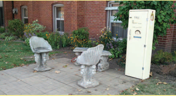
The "little library" in St. John's outdoor community greenspace.