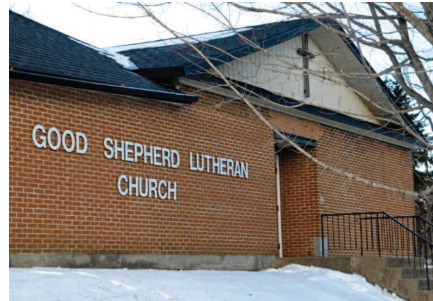
Trinity New Hamburg now boasts a newly renovated public space, thanks to a timely ELFEC partner grant.

Good Shepherd has no plans to withdraw their capital anytime soon, but they like knowing their funds are accessible if needed. Until then, they'll use their interest to meet their annual budget, including their commitment to benevolence giving to the Eastern Synod.