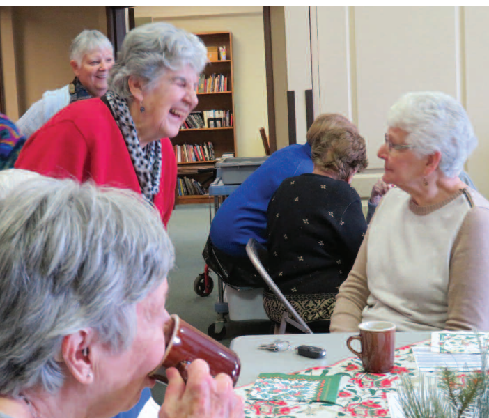
Mount Zion Café meets twice a month in the now brightly-lit Delton Glebe Fellowship room.

Mount Zion Waterloo was on a mission to replace its energy-hogging fluorescent light fixtures with bright, efficient LEDs. But it was an expensive proposition. Luckily, their project was a perfect fit for ELFEC's new Partner Grant Program.