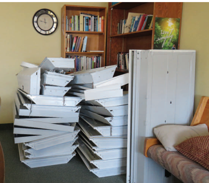
Some of Mount Zion's almost-200 old fluorescent fixtures replaced by energy-efficient LED bulbs, thanks to help from ELFEC's new Partner Grant.

A few years ago Waterloo's Mount Zion realized they had to do something about their sanctuary lighting. Dark spots throughout the space made it difficult for members to read, plus every time a bulb burned out they had to send a property committee volunteer up a 20+ foot ladder.