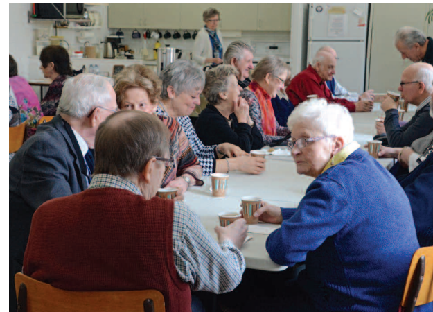
Good Shepherd's congregation rests easy, confident their investments are being well managed on their behalf.

ELFEC helps congregations grow their assets through faithful investing that promotes justice and respects God's creation. Call any time for advice or information 1.888.308.9461.